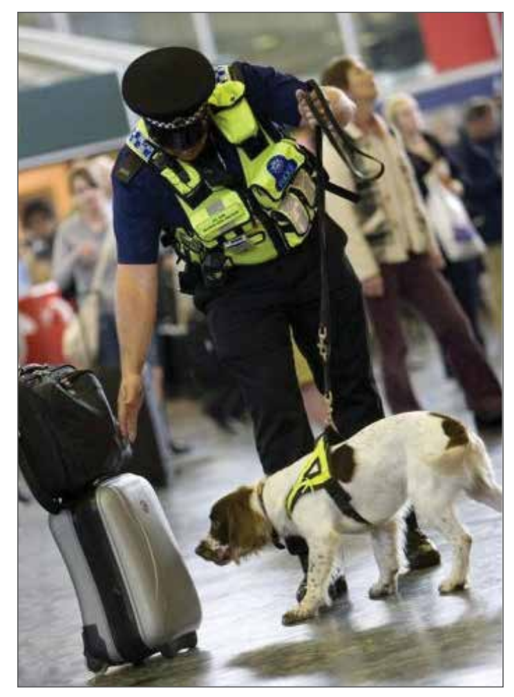
The standard mission of BTP is to deliver a safe railway environment free from disruption and the fear of crime.

BTP continue to be supported in their use of ERDAS APOLLO by Hexagon Geospatial business partner Sterling GEO in the UK. Whilst the games are now over, the work goes on ensuring rapid data cataloguing and delivery.